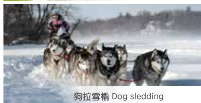
狗拉雪橇 Dog sledding