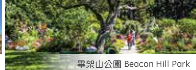
畢架山公園 Beacon Hill Park