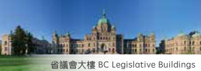
省議會大樓 BC Legislative Buildings