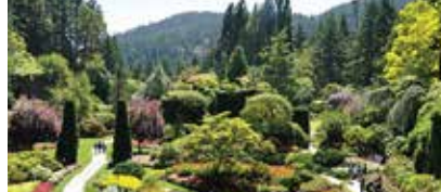
布查特花園 Butchart Gardens