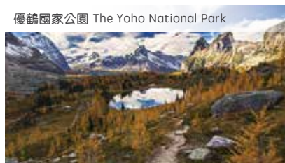
優鶴國家公園 The Yoho National Park